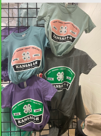
Youth Shirt Colors