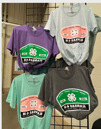
Adult Shirt Colors

https://www.companycasuals.com/4HSParkTees