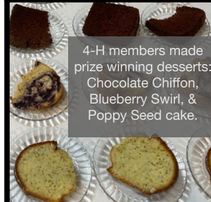
4-H members made prize winning desserts: Chocolate Chiffon, Blueberry Swirl, & Poppy Seed cake.