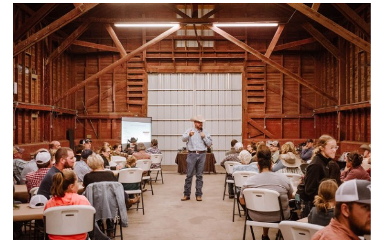
Above: Over 75 people attended the Open House event held at the Winfield Fairgrounds. Below: Youth had to "catch" their calves; some steers played hard to get.

at the 2023 Cowley County Fair. All 4-Hers will have the opportunity to evaluate the animals at the fair and then evaluate meat quality on the rail post-fair.