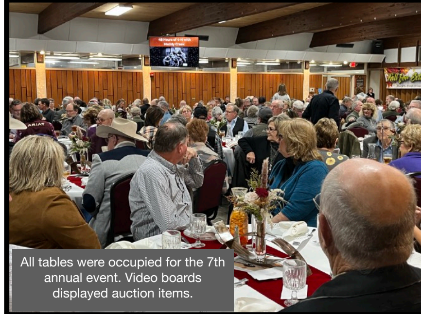
All tables were occupied for the 7th annual event. Video boards displayed auction items.

Dinner tickets All tables sold! $30 seat or $225 for table for 8